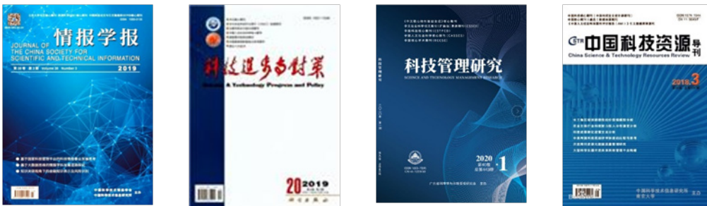
FIGURE 5 Selected Chinese periodicals covering open source S&T intelligence

These journals are a small sample of the inventory. Each of China’s 31 provinces, special municipalities, and autonomous regions is host to one or more journals, including the present authors’ two personal favorites. 149 A recent Chinese bibliometric study of these provincial STI journals concludes that “provincial STI institutions are the backbone and supporting force of China’s scientific and technological intelligence industry.” 150 The study named ten provincial STI organizations, whose journal content ranked in a top 20 list of frequently cited articles. 151 They included STI “institutes” (研究所) or “academies” (研究院) in Beijing, Guangdong, Hebei, Hubei, Jiangsu, Jiangxi, Shaanxi, Shanxi, Shanghai, and Sichuan.*